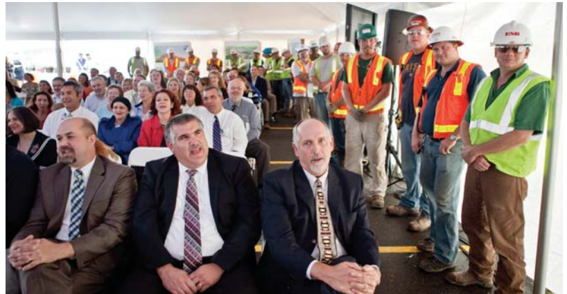
Attendees boisterously instruct contractors working at the construction site to drive the pile that will be used in forming the foundation for the New Regional Hospital.