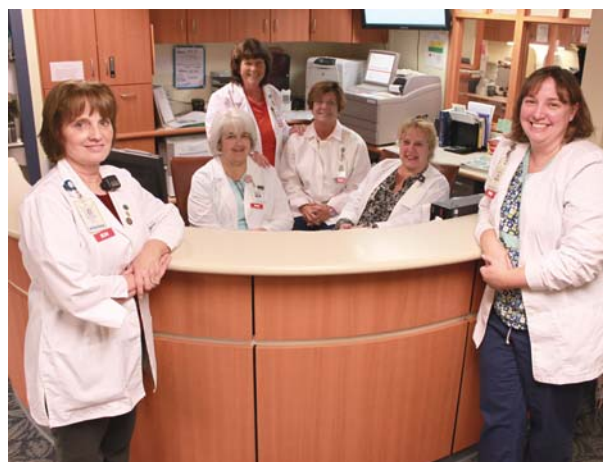
MGH Nurse Managers lead their teams to an historic achievement of 71% of inpatients rating their experience a '9 or 10' for the last quarter. This accomplishment is the result of our culture-change efforts and illustrates our commitment to enhancing patient satisfaction.

That's why more than half of MaineGeneral employees have